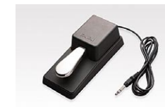
F-10H damper pedal