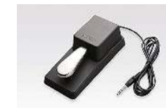
F-10H damper pedal