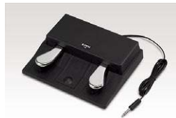
F-20 damper/soft pedal