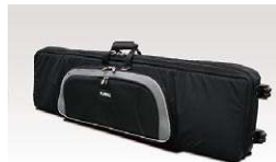
Gig-bag with castors