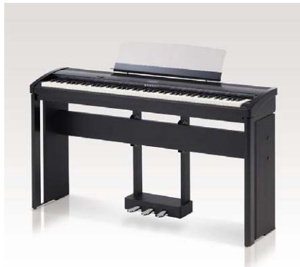
HM-4 designer stand, F-301 triple pedal (sold separately)