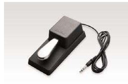
F-10H damper pedal