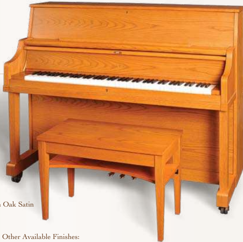
Shown in Oak Satin

With its unmatched combination of durable construction and exceptional playability, the UST-9 outperforms every instrument in its class. Our master craftsmen designed it to exceed the most demanding institutional requirements. But the UST-9 goes far beyond every standard by offering the world's most advanced upright piano action and design enhancements that set it apart from any other institutional piano. Experience the UST-9 and see why it is the choice of "those who know."